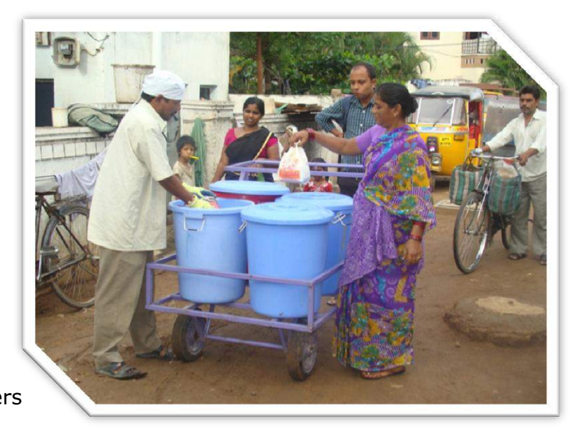
Waste being segregated before collection

Despite repeated requests by the community to extend waste collection services in the slum there was no positive response from the Greater Hyderabad Municipal Corporation (GHMC). The Basthi Vikas Manch (BVM) members decided to find an alternative for collecting their household waste. An exclusive training programme was organised for the BVM members