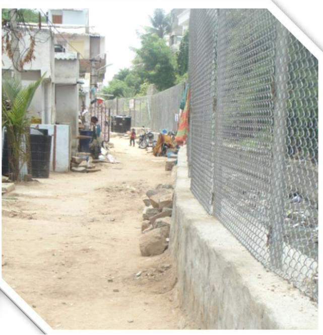
Before project intervention (1/3/2014)