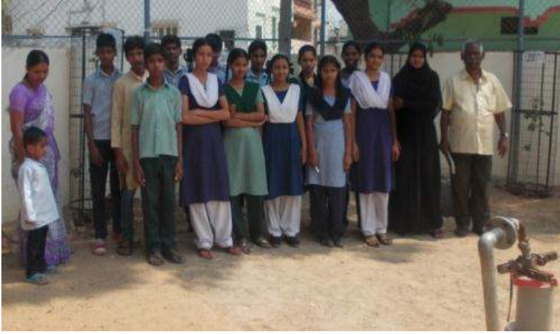
The school advocacy team of the Government school, Rasoolpura

now become green zone with trees planted and garbage bins in place. BVM is now striving to make it into a school model by getting regular water supply and functional toilets. However, the process with the government is very slow, even in the provision of basic services to school.