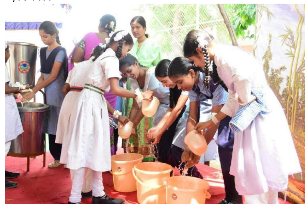
Children demonstrating hand washing lessons on Global Hand Washing Day

iii. Global Hand Washing Day was organized along with the slum communities on October 15th at the Gun Bazaar school, Rasulpura, Hyderabad